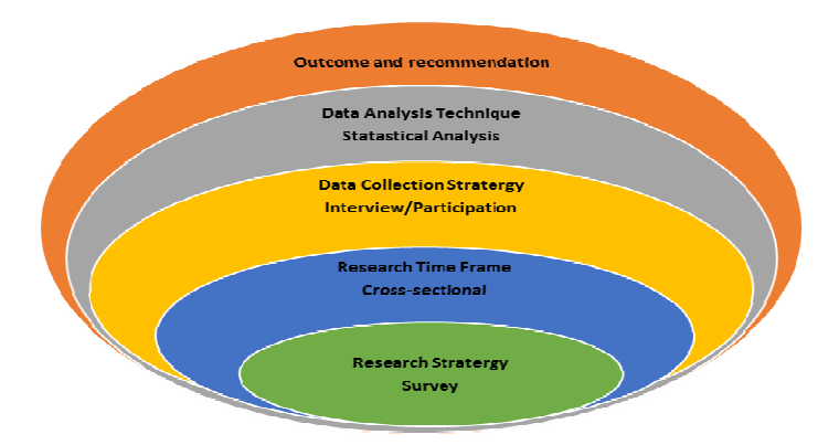
Figure 1: Research Methodology

Some Studies on Cost Overrun Factors Affecting Repairs and Rehabilitation of Buildings